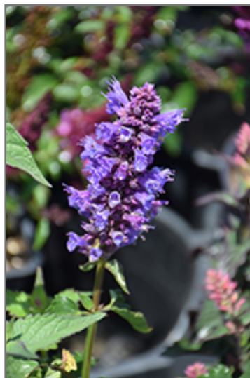
Blue Boa Hyssop flowers