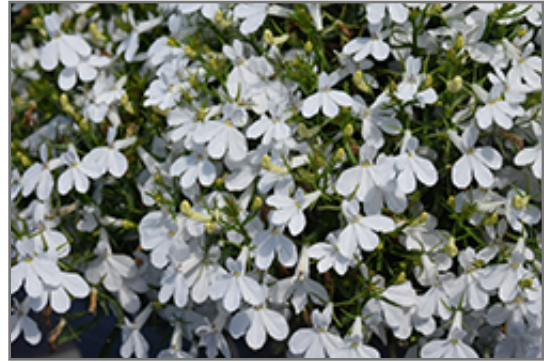
Techno Upright White Lobelia flowers

Techno Upright White Lobelia is recommended for the following landscape applications;