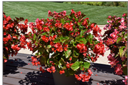
Whopper Red Green Leaf Begonia flowers