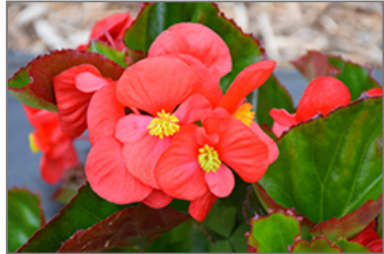
Big Red Green Leaf Begonia flowers

This is a high maintenance plant that will require regular care and upkeep, and usually looks its best without pruning, although it will tolerate pruning. Deer don't particularly care for this plant and will usually leave it alone in favor of tastier treats. Gardeners should be aware of the following characteristic(s) that may warrant special consideration;