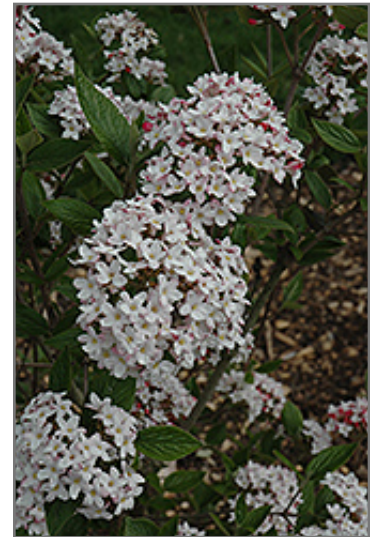
Mohawk Viburnum flowers

Our Growing Place Choice plants are chosen because they are strong performers year after year, staying attractive with less maintenance when planted in the right place.