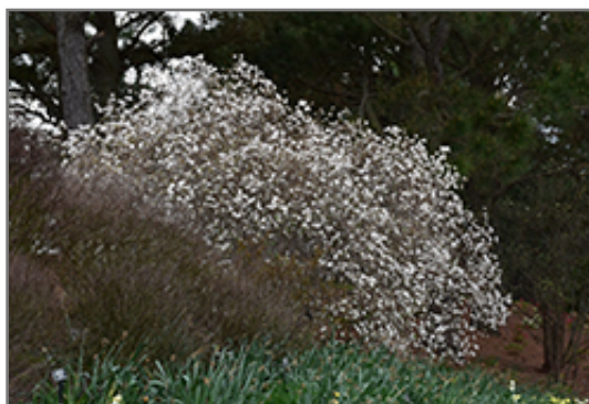
Mohawk Viburnum in bloom