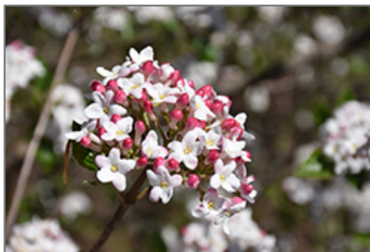
Mohawk Viburnum flowers

Mohawk Viburnum is recommended for the following landscape applications;