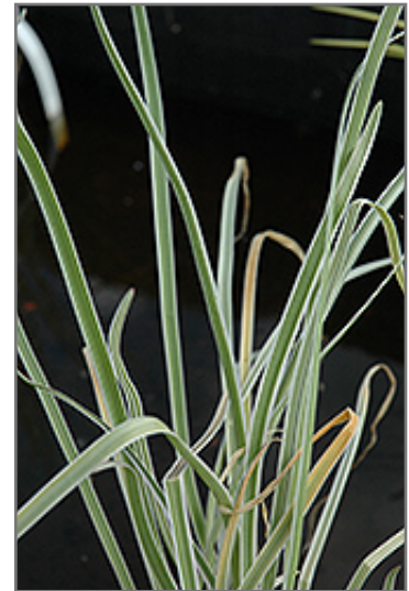
Variegated Society Garlic foliage

This plant is quite ornamental as well as edible, and is as much at home in a landscape or flower garden as it is in a designated herb garden. It does best in full sun to partial shade. It prefers to grow in moist to wet soil, and will even tolerate some standing water. It is not particular as to soil type or pH. It is somewhat tolerant of urban pollution. This is a selected variety of a species not originally from North America. It can be propagated by division; however, as a cultivated variety, be aware that it may be subject to certain restrictions or prohibitions on propagation.