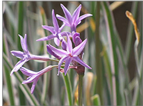
Variegated Society Garlic flowers