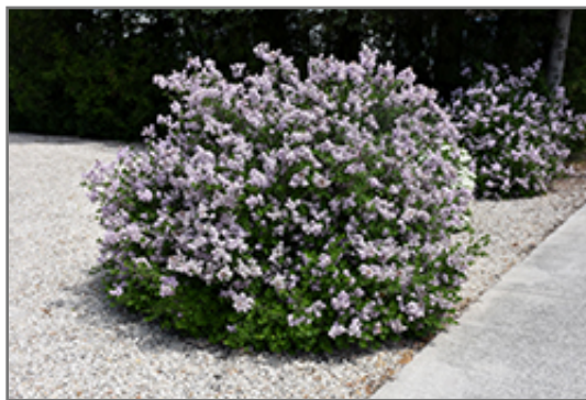
Dwarf Korean Lilac in bloom