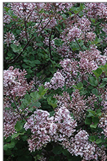
Dwarf Korean Lilac flowers

Dwarf Korean Lilac is recommended for the following landscape applications;