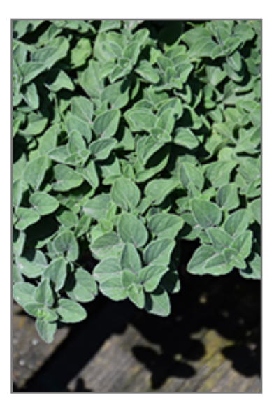
Hot And Spicy Oregano foliage

Aside from its primary use as an edible, Hot And Spicy Oregano is sutiable for the following landscape applications;