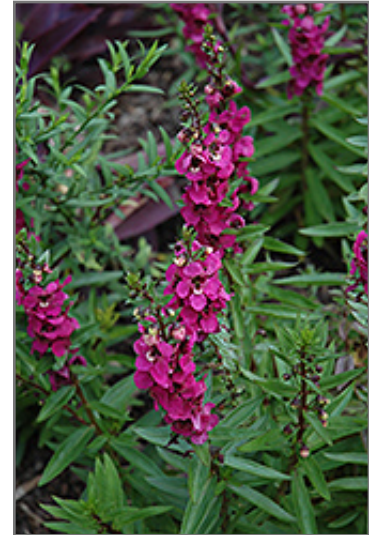
Serenita Raspberry Angelonia flowers

Serenita Raspberry Angelonia is recommended for the following landscape applications;