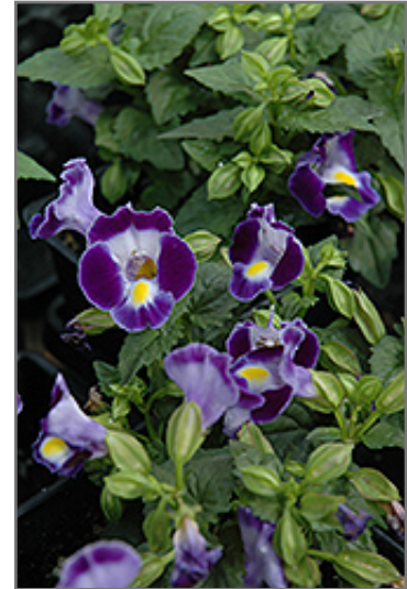
Catalina Midnight Blue Torenia flowers

Catalina Midnight Blue Torenia is recommended for the following landscape applications;