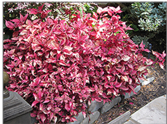
Blood Leaf