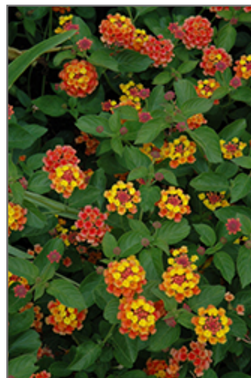
Landmark Citrus Lantana flowers