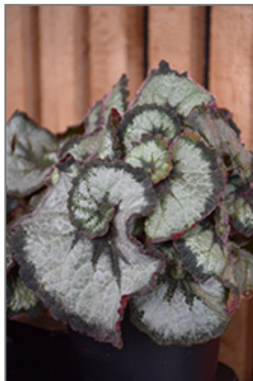
Escargot Begonia foliage