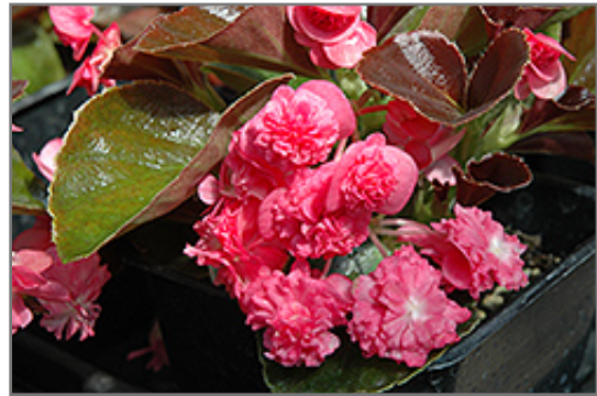
Doublet Rose Begonia flowers