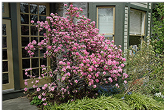
Olga Mezitt Rhododendron in bloom