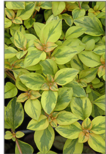
Walkabout Sunset Loosestrife foliage

Walkabout Sunset Loosestrife is recommended for the following landscape applications;