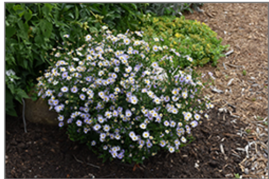
Blue Star Japanese Aster in bloom