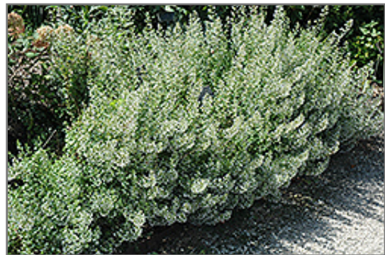
Montrose White Dwarf Calamint in bloom