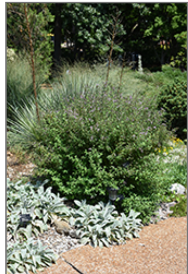
Leptodermis in bloom