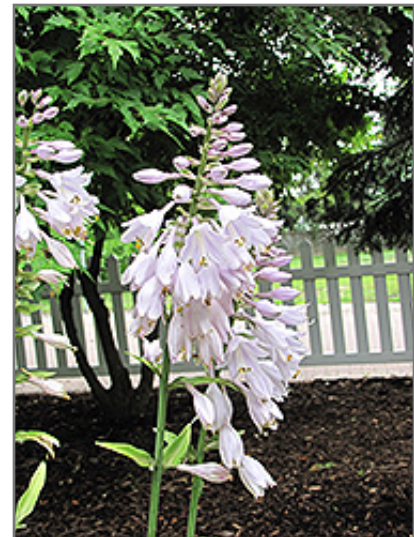
Key West Hosta flowers