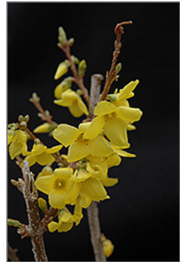
Show Off Forsythia flowers

Our Growing Place Choice plants are chosen because they are strong performers year after year, staying attractive with less maintenance when planted in the right place.