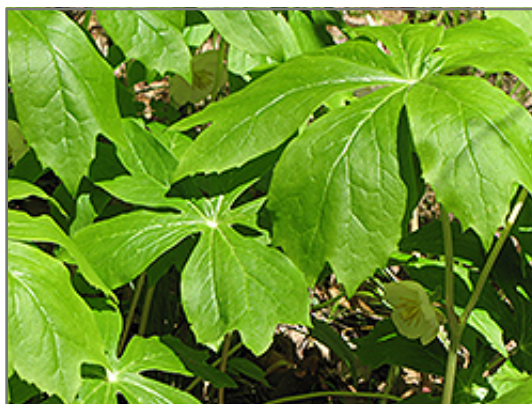
Mayapple foliage