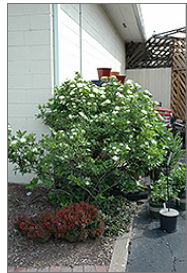
Winterthur Viburnum in bloom