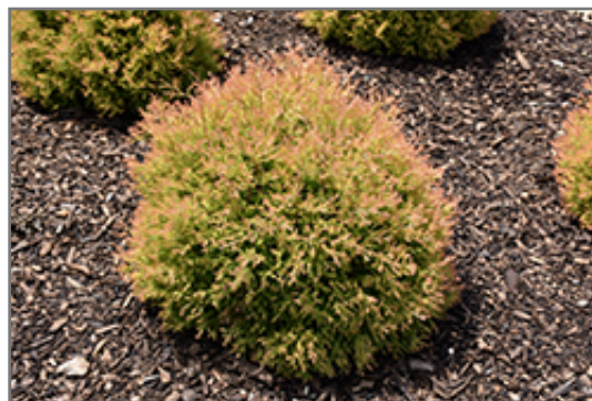
Fire Chief Arborvitae

Fire Chief Arborvitae is recommended for the following landscape applications;