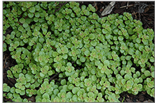
Golden Stonecrop