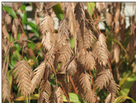
Northern Sea Oats fruit

Northern Sea Oats will grow to be about 4 feet tall at maturity, with a spread of 30 inches. Its foliage tends to remain dense right to the ground, not requiring facer plants in front. It grows at a medium rate, and under ideal conditions can be expected to live for approximately 10 years.