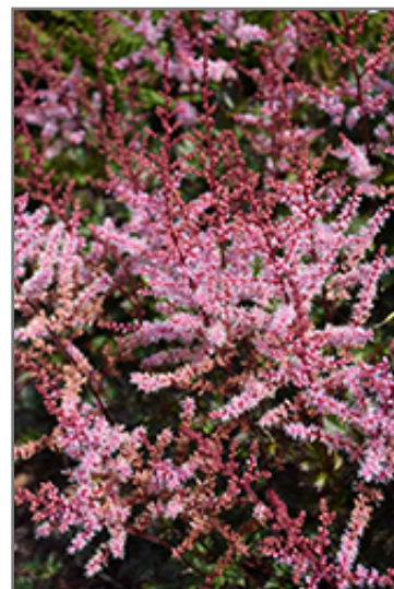
Delft Lace Astilbe flowers

This is a relatively low maintenance plant, and is best cleaned up in early spring before it resumes active growth for the season. It is a good choice for attracting butterflies to your yard, but is not particularly attractive to deer who tend to leave it alone in favor of tastier treats. It has no significant negative characteristics.