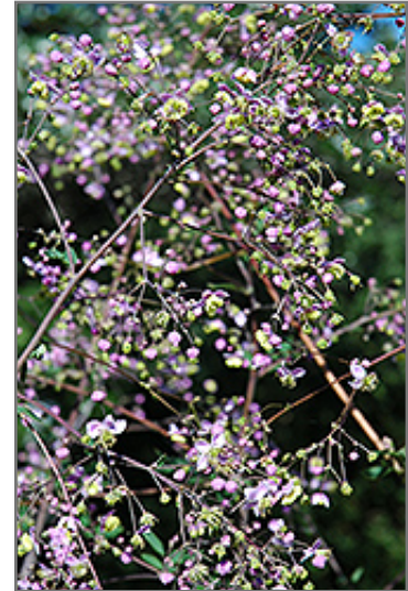
Rochebrun Meadow Rue flowers