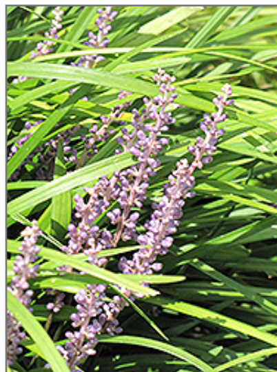
Lily Turf flowers