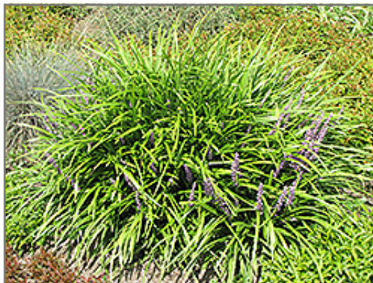
Lily Turf in bloom