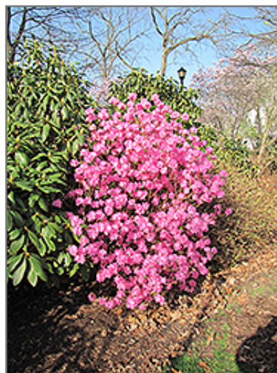
Landmark Rhododendron in bloom