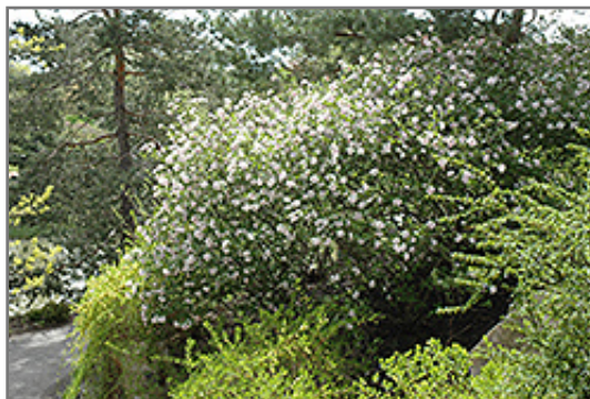
Judd's Viburnum in bloom