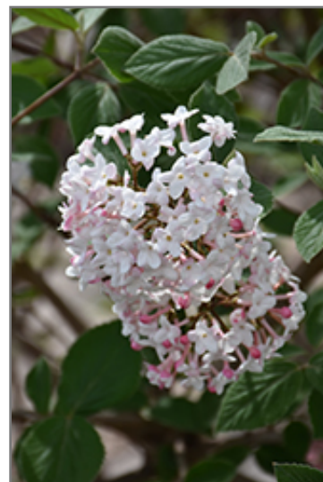
Judd's Viburnum flowers

This is a relatively low maintenance shrub, and should only be pruned after flowering to avoid removing any of the current season's flowers. It is a good choice for attracting birds to your yard, but is not particularly attractive to deer who tend to leave it alone in favor of tastier treats. It has no significant negative characteristics.