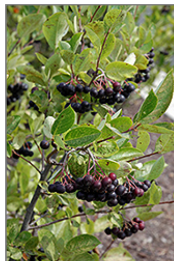
Iroquois Beauty Black Chokeberry fruit