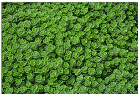
John Creech Stonecrop foliage

John Creech Stonecrop will grow to be only 3 inches tall at maturity, with a spread of 12 inches. When grown in masses or used as a bedding plant, individual plants should be spaced approximately 10 inches apart. Its foliage tends to remain low and dense right to the ground. It grows at a fast rate, and under ideal conditions can be expected to live for approximately 10 years. As an herbaceous perennial, this plant will usually die back to the crown each winter, and will regrow from the base each spring. Be careful not to disturb the crown in late winter when it may not be readily seen!