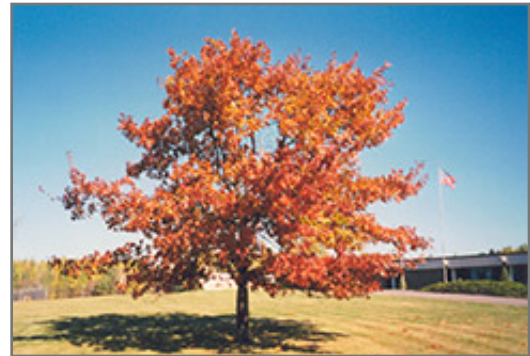
Red Oak in fall