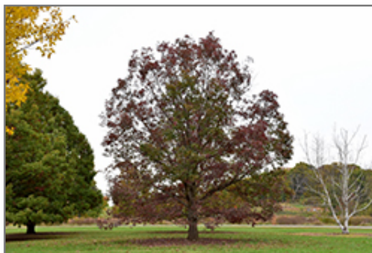
White Oak in fall

Our Growing Place Choice plants are chosen because they are strong performers year after year, staying attractive with less maintenance when planted in the right place.