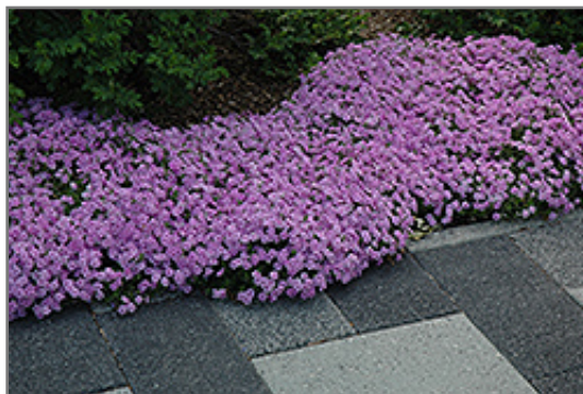
Fort Hill Moss Phlox in bloom