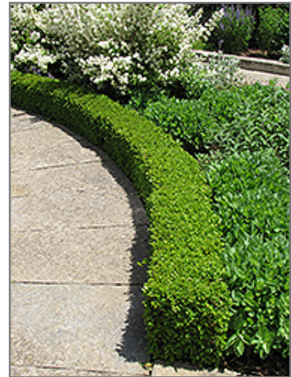
Green Velvet Boxwood

Our Growing Place Choice plants are chosen because they are strong performers year after year, staying attractive with less maintenance when planted in the right place.