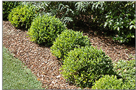
Green Velvet Boxwood