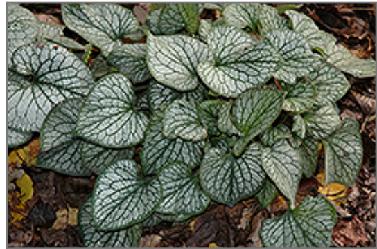
Jack Frost Bugloss