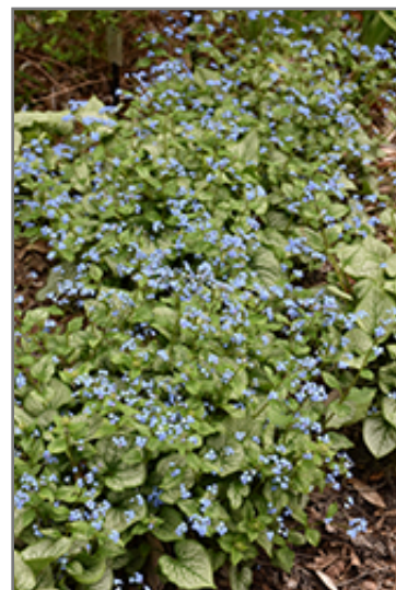
Jack Frost Bugloss in bloom

Our Growing Place Choice plants are chosen because they are strong performers year after year, staying attractive with less maintenance when planted in the right place.