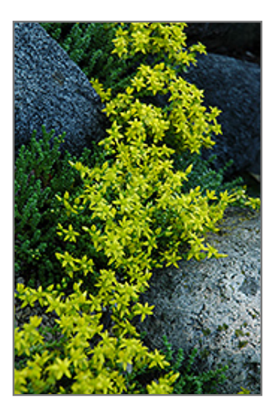
Six Row Stonecrop flowers