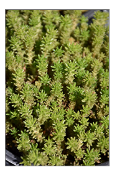
Six Row Stonecrop foliage

This plant does best in full sun to partial shade. It prefers dry to average moisture levels with very well-drained soil, and will often die in standing water. It is considered to be drought-tolerant, and thus makes an ideal choice for a low-water garden or xeriscape application. It is not particular as to soil pH, but grows best in poor soils, and is able to handle environmental salt. It is highly tolerant of urban pollution and will even thrive in inner city environments. This species is not originally from North America. It can be propagated by division.