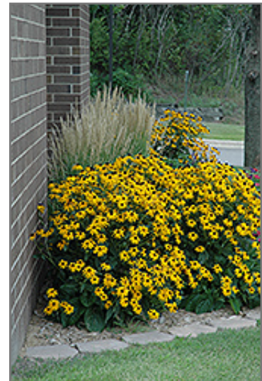
Goldsturm Coneflower in bloom