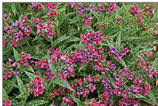
Raspberry Splash Lungwort flowers