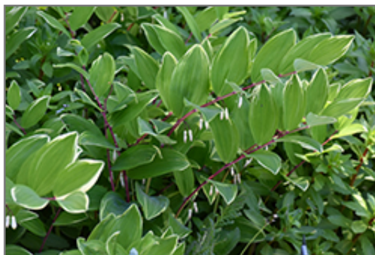
Variegated Solomon's Seal flowers