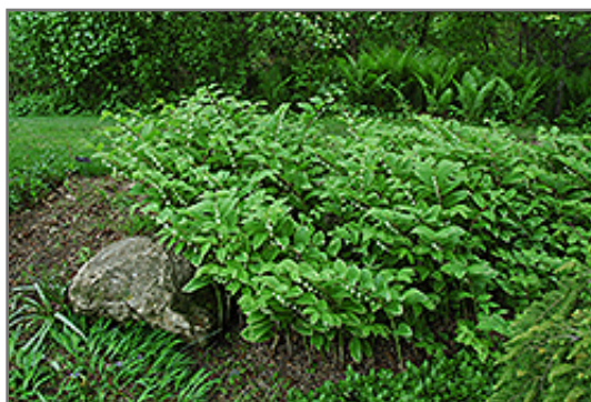
Variegated Solomon's Seal in bloom