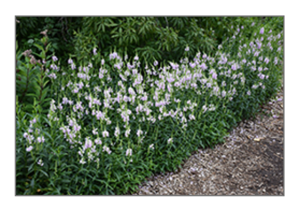
Obedient Plant in bloom