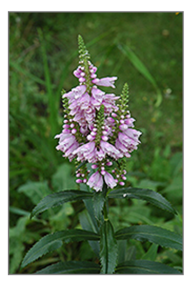
Obedient Plant flowers