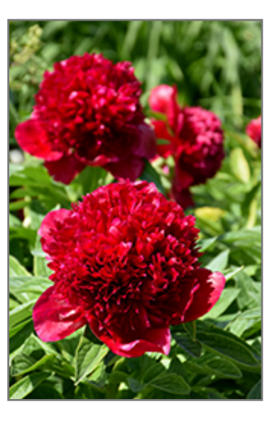
Red Charm Peony flowers

Red Charm Peony will grow to be about 30 inches tall at maturity, with a spread of 3 feet. When grown in masses or used as a bedding plant, individual plants should be spaced approximately 30 inches apart. The flower stalks can be weak and so it may require staking in exposed sites or excessively rich soils. It grows at a slow rate, and under ideal conditions can be expected to live for approximately 20 years. As an herbaceous perennial, this plant will usually die back to the crown each winter, and will regrow from the base each spring. Be careful not to disturb the crown in late winter when it may not be readily seen!