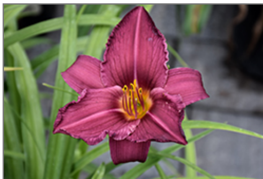
Summer Wine Daylily flowers

Stunning ruffled, plum purple flowers with luminous yellow centers make an appearance early to mid season; long, slender arching foliage; low maintenance and easy to grow; an elegant addition to perennial beds and borders