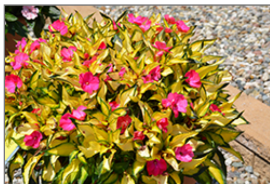
SunPatiens Compact Tropical Rose New Guinea Impatiens in bloom