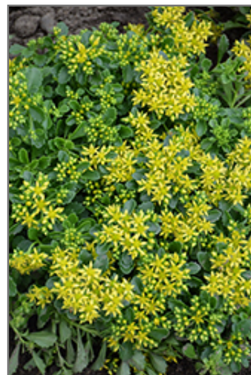
Little Miss Sunshine Stonecrop flowers

Little Miss Sunshine Stonecrop is recommended for the following landscape applications;