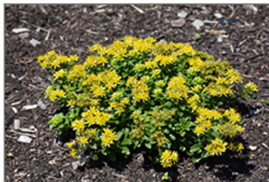
Little Miss Sunshine Stonecrop in bloom