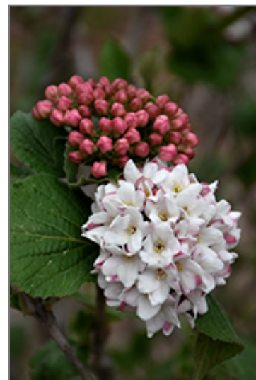
Spice Island Koreanspice Viburnum flowers

Spice Island Koreanspice Viburnum is recommended for the following landscape applications;