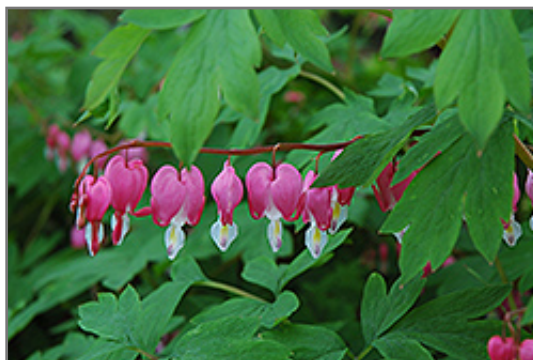
Common Bleeding Heart flowers