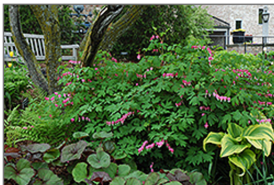
Common Bleeding Heart in bloom