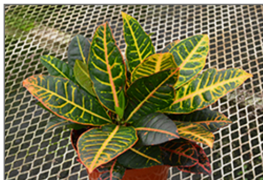
Petra Variegated Croton in full